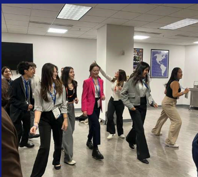
DANCING AT THE SOCIAL MIXER

In the face of misfortune, the MOAS Coordination Team organized a mixer full of trivia, dancing, laughing, fun, and cultural exchanges. Thursday's mixer was held in the same building as the Committee of Hemispheric Security and Committee in Juridical and Political Affairs. Participants enjoyed food and drink while dancing and sharing cultural artifacts like pins, candies, and flags. This activity shows what the MOAS experience is all about fostering long-lasting friendships between youth across the hemisphere.