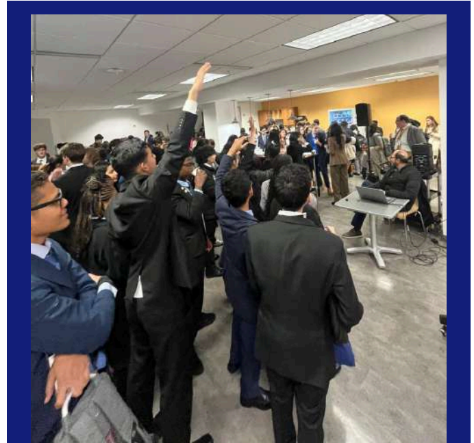
PARTICIPATING IN TRIVIA